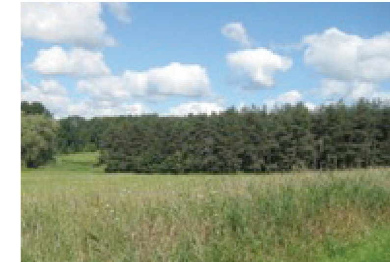
In the fall of 2010, CPF protected an additional 427 acres of farmland through conservation easements, bringing its total to 1,914 acres of protected land in the Cazenovia area. With these additions, nine percent of the total land in the Town of Cazenovia is protected by conservation easements, CPF ownership, and public entities.

Thanks to the trail stewards and others that have alerted us to conditions in the field. Please also send along any interesting wildlife observations that you make. When revising our brochures we